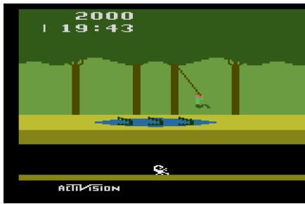
Figure 1: Screenshot of PITFALL!.

Atari 2600 hardware limits the possible complexity of games, which we believe strikes the perfect balance: a challenging platform offering conceivable near-term advancements in learning, modelling, and planning.